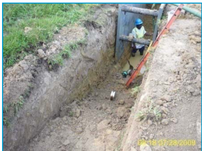
Trench boxes are used for pipeline installation.