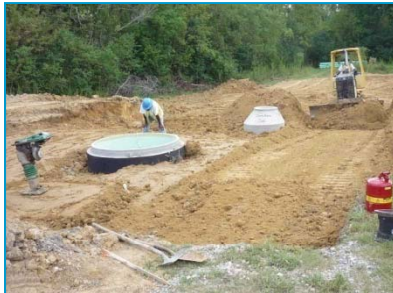
Wet wells and manholes are frequently upgraded during construction.

The project increased the capacity of the STN force main system and the manifold force mains along Foster Road and Hooper Road to assist in transferring high flows to the main STN force main along Hooper Road.