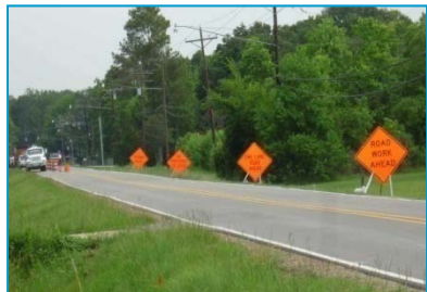
Signage notifies residents of underground construction activities.